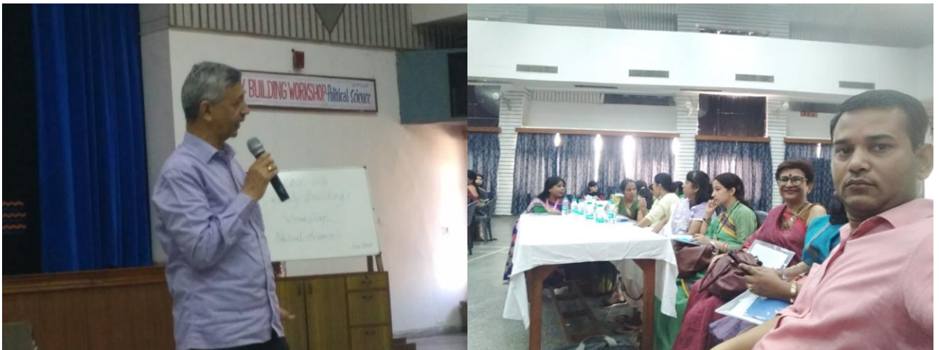
Workshop in progress

The programme ended with a feedback session and vote of thanks given by the Principal.