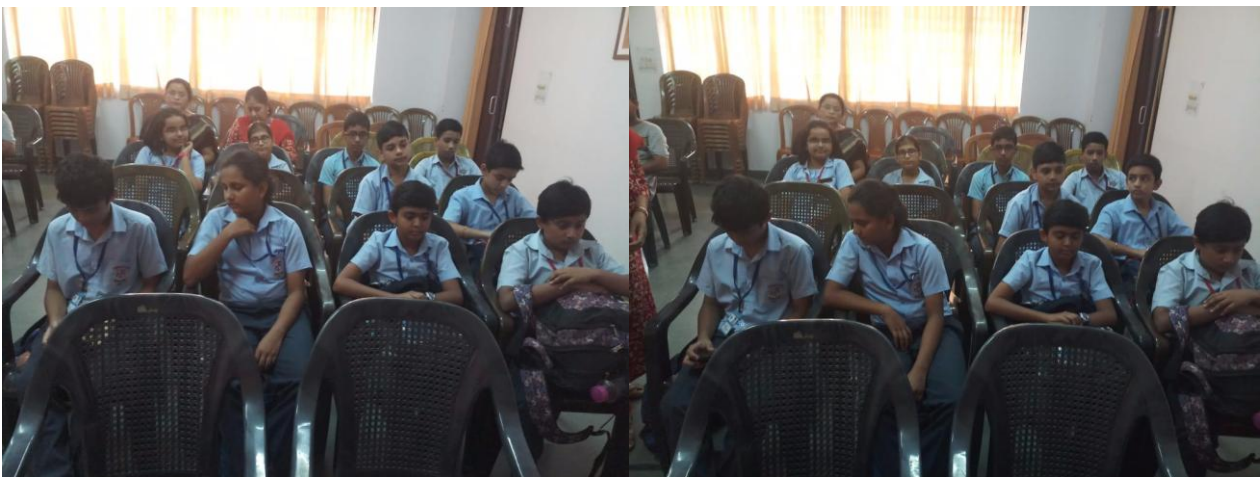
Students at the Theatre Presentation